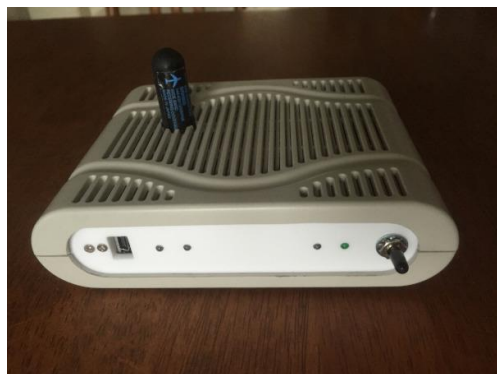
Figure 2: Portable hotspot

The second hotspot I built used the DVMega and a Raspberry Pi 1 B+ (this Pi is an upgrade on the one used previously). I built this Hotspot into an old router case, it included a rechargeable battery and inbuilt charger, which made it portable.