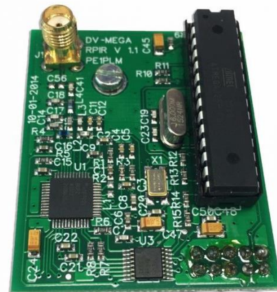
Figure 1: DVMega

It's transmitter is only 10mW. Using the DVMega it is possible to make a compact and portable Hotspot.